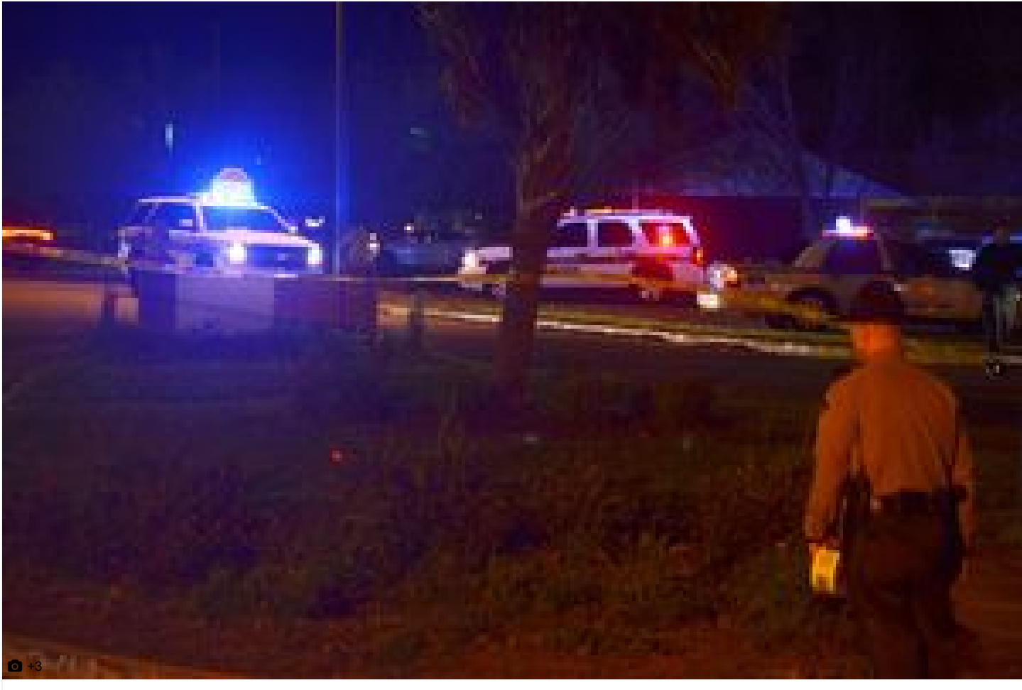
Aiken Public Safety increase presence at 2 high schools after shooting at South Aiken

Maayan Schechter is the digital news editor of the Aiken Standard. Reach her at 803-644-2395.