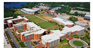
North Carolina State University