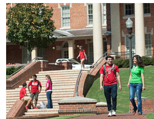
North Carolina State University